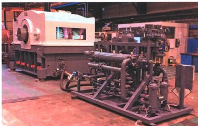
Jumborex NEO inspection windows and LED lighting.

The supervision of installation and commissioning of the Jumborex NEO would be handled by the CMD service department. All in all, the company