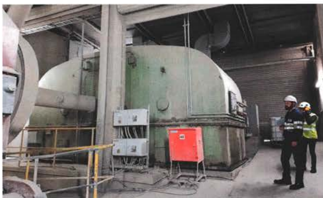
Existing older split torque gearbox – running conditions: 2000 kW at 496 RPM, ratio: 29.97:1.