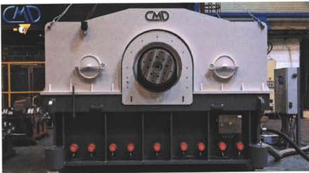
CMD Jumborex NEO at the CMD factory.

Vertical and horizontal milling technologies are used. If horizontal, these mills can be laterally or centrally driven. The first historical solution that is still widely used is the laterally-driven horizontal mill. Another solution is the vertical mill, using a vertical planetary gearbox. Finally, the design that is of interest here is the central drive horizontal mill.