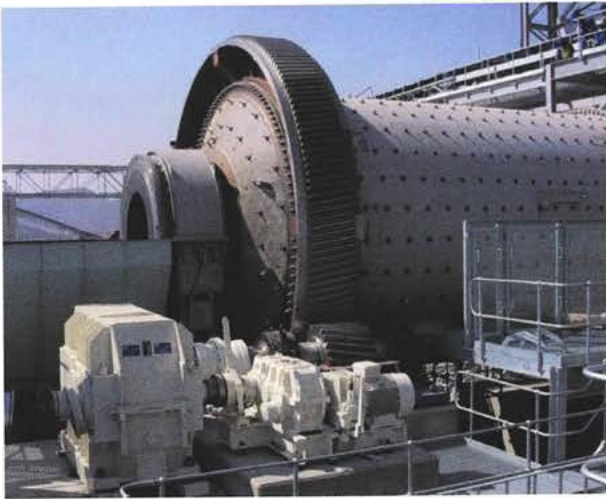
Typical layout of a lateral drive horizontal mill.