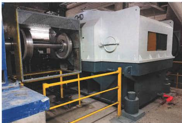
Newly installed interchangeable Jumborex NEO.