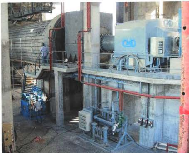
Typical set up of central drive ball mill

The benefits of this central drive design compared to lateral driven mills are, amongst other things, a reduction in equipment (there is no girth gear, pinion, girth gear cover, etc.), which makes the solution more reliable and easier to maintain. It also decreases the volume of lubricant used because the lubricant is recycled in the closed loop gearbox. The maintenance cost is therefore reduced.