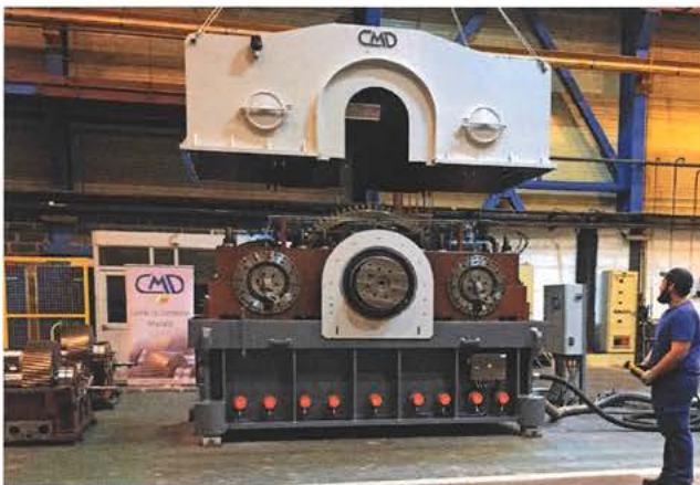
Jumborex NEO opening in 30 sec.