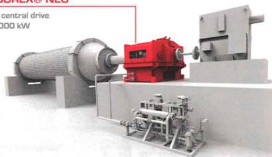
Typical view of drop-in Jumborex NEO.

offered a turnkey project matching our expectations. We selected the system based on the following considerations: