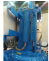
Rake position lights