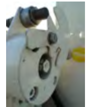
Torque limiter control & security switch