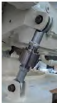
Stainless steel torque sensor