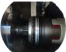
Security torque limiter